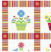
4032-M White Panel