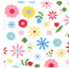
4034-M White Mixed Flowers (for backing)