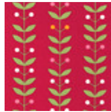
4033-R Red Vine